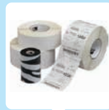
Consumables (labels, ribbons, PVC cards)